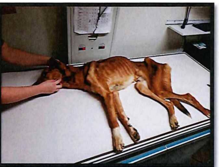
Starved to near death.

Your Wisconsin Humane Societies, Animal Shelters and Rescues Organizations are often tasked with the care of the animal victims of egregious abuse. Under current statute, we lack the legal tools needed to provide justice and safety for abused animals.