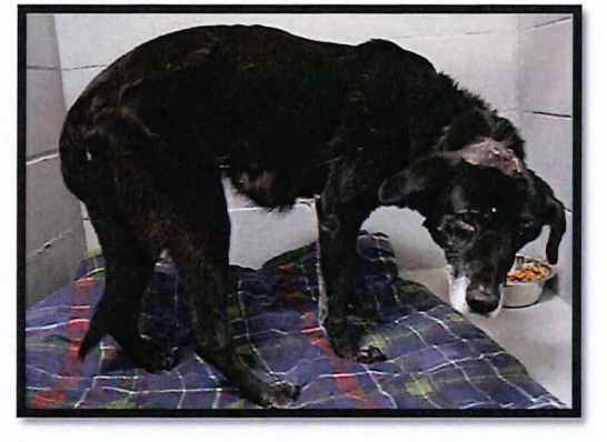
Beaten and left for dead.

The photos below are from Wisconsin animal shelter cases. This abuse is currently a misdemeanor crime!