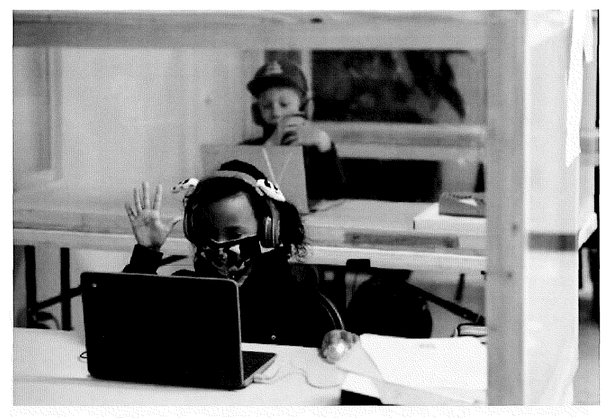
Students follow along remotely with their regular school teacher's online live lesson separated by plastic barriers at STAR Eco Station Tutoring and Enrichment Center on Sept. 10, 2020, in Culver City, Calif.