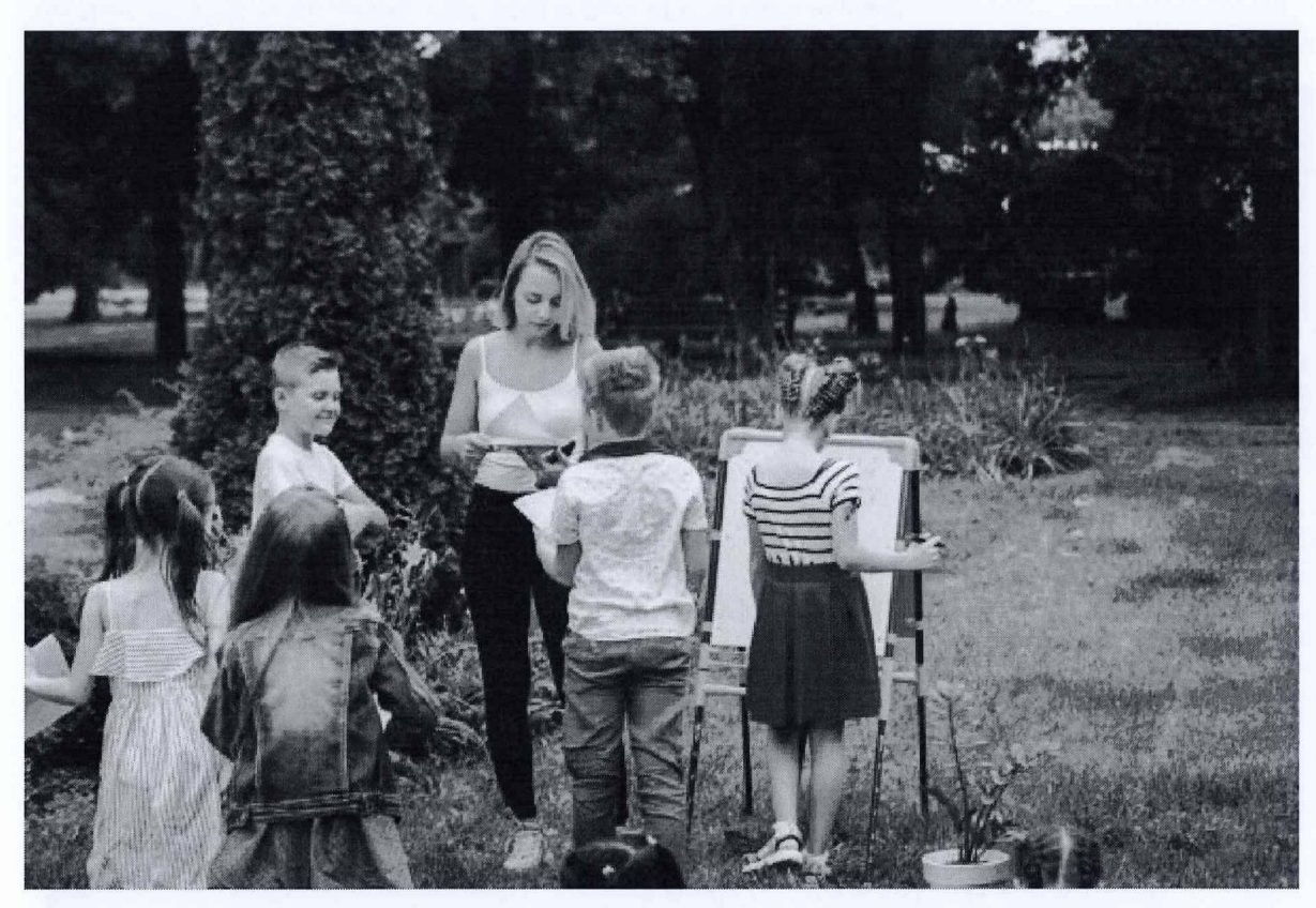
In learning pods, or micro-schools, small groups of families take turns teaching children, or pool resources to hire a teacher.