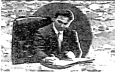
Gov. Ron DeSantis

It aims to incentivize developers of affordable, workforce housing with tax breaks, zoning workarounds