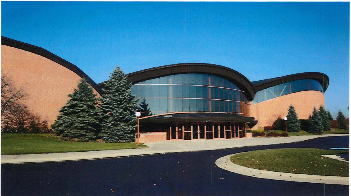
Johnson Athletic Center