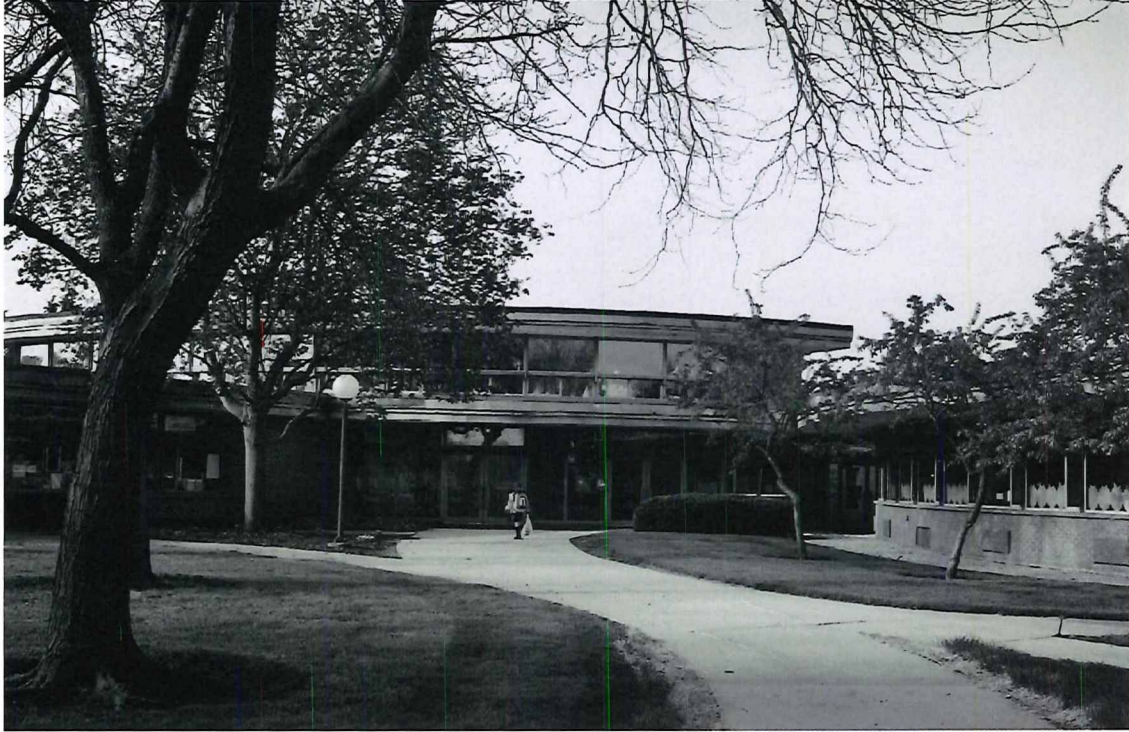
Main Entrance - timeless Taliesin Architecture