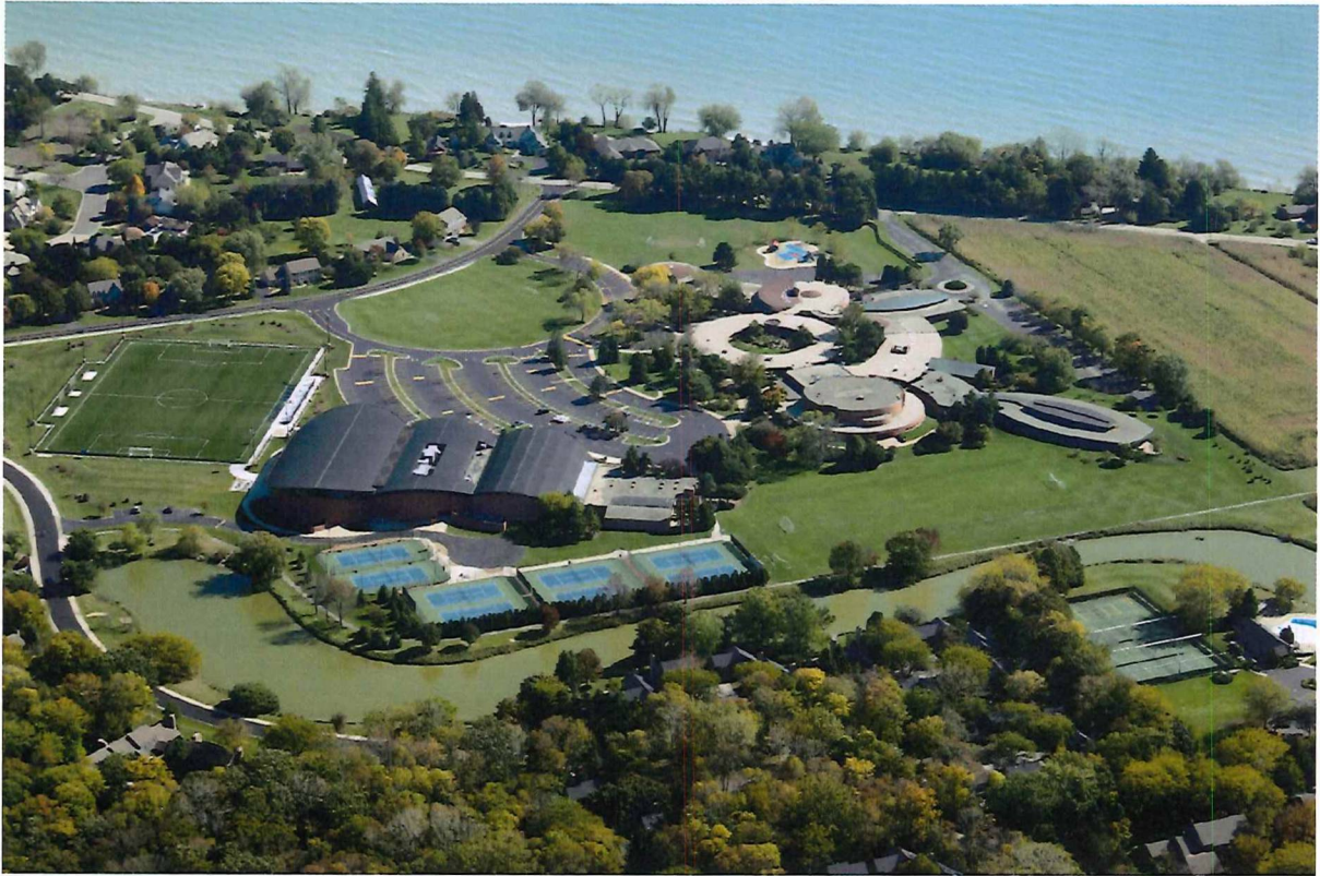
The Prairie School