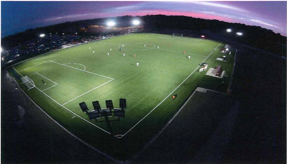
Ruud Family Soccer Complex