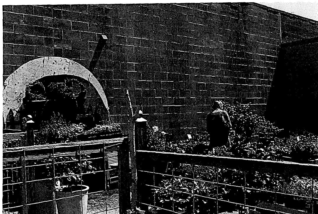
The Avid Gardener, a plant store in Cambridge.

Wisconsinites' ability to spend summers enjoying homegrown herbs, fruits and vegetables could be codified into law under legislation proposed earlier this month by two Republican lawmakers.