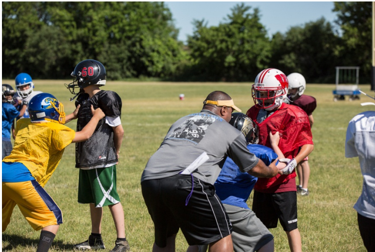
Warhawk Football Camp, UW-Whitewater