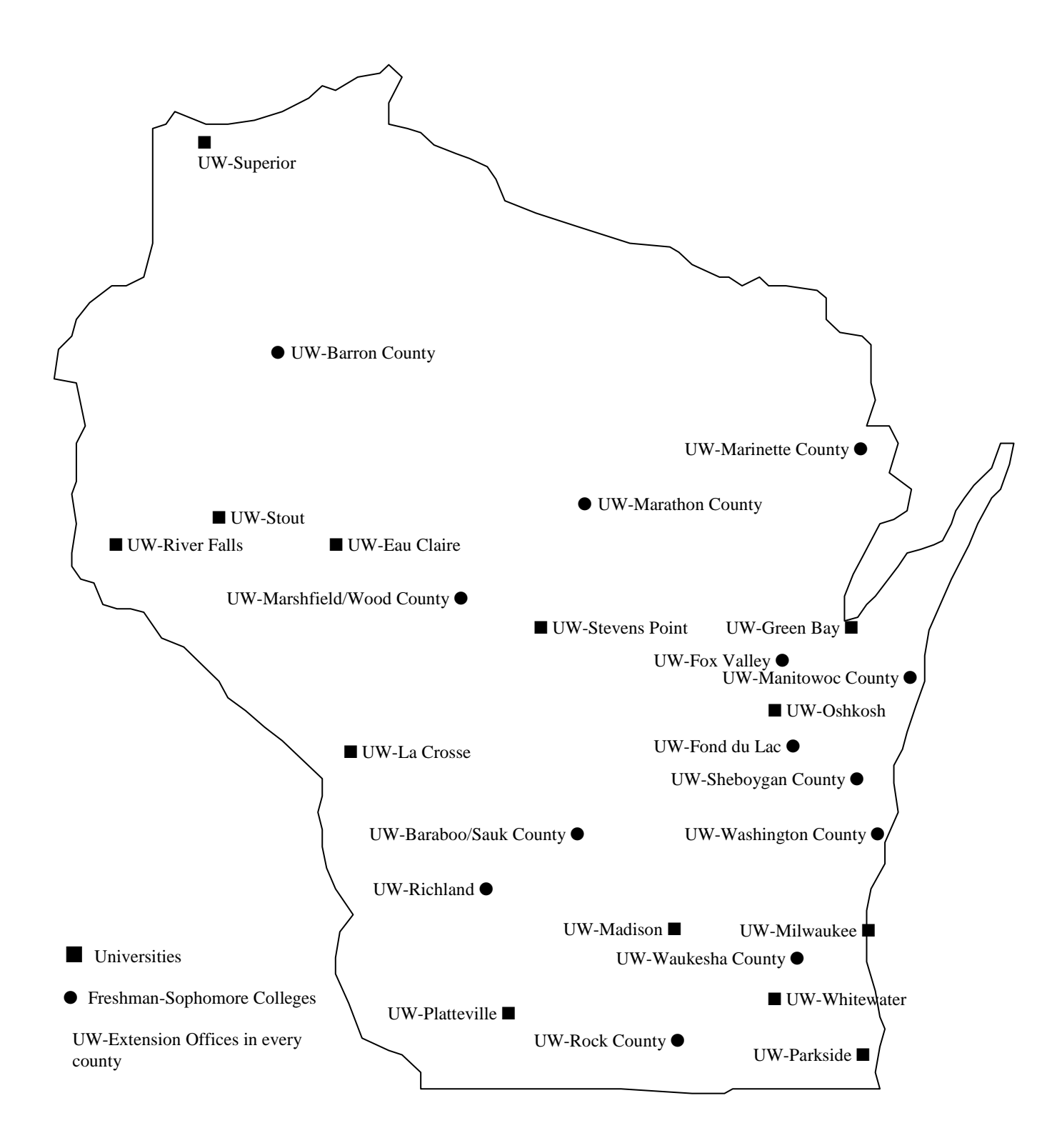
FIGURE I Campuses of the University of Wisconsin System