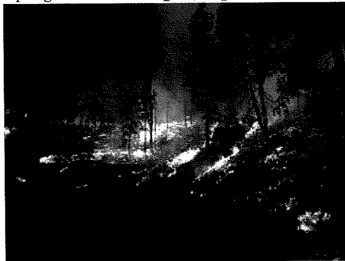
Graphic 2: Schneider Springs Fire in Washington, August 18, 2021

Source: https://inciweb.nwcg.gov/incident/photographs/7775/120/