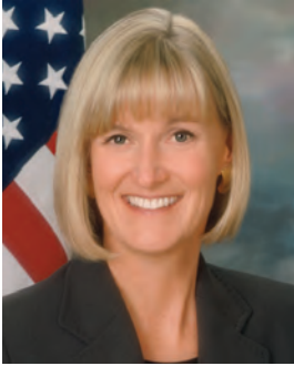
Lieutenant Governor LAWTON