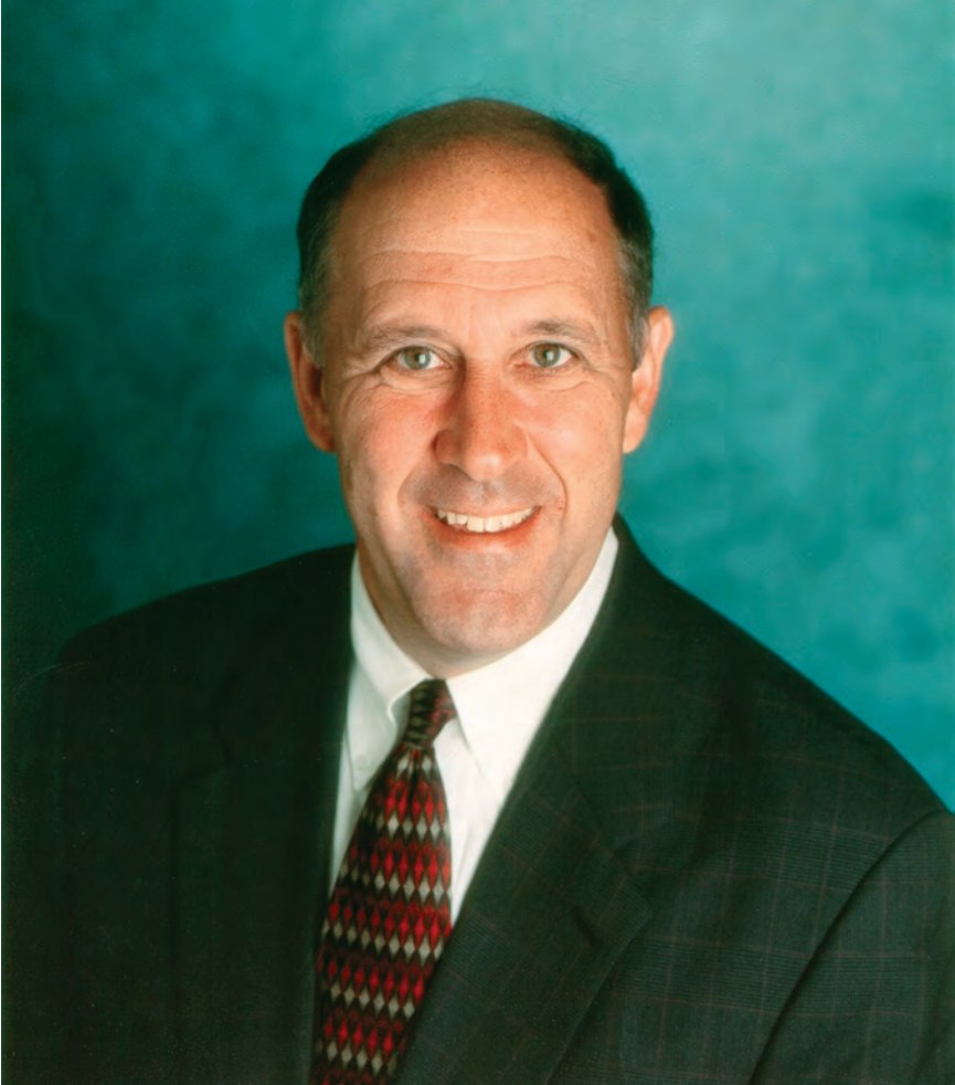
Governor JIM DOYLE