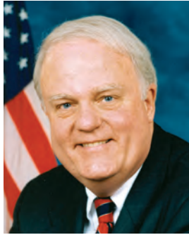
U.S. Representative SENSENBRENNER