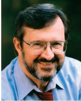
U.S. Representative OBEY