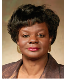
U.S. Representative MOORE