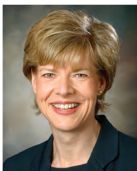
U.S. Representative BALDWIN