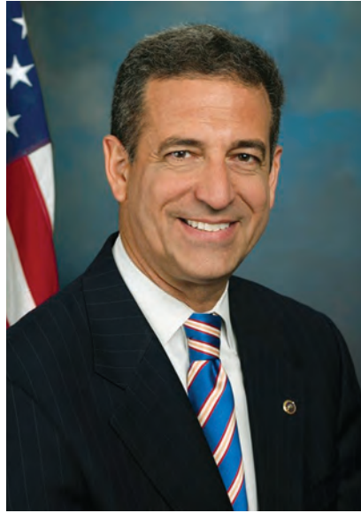
U.S. Senator FEINGOLD