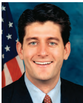
U.S. Representative RYAN