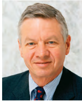
U.S. Representative PETRI