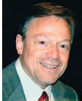
U.S. Representative KAGEN