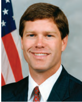
U.S. Representative KIND