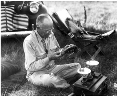
Aldo Leopold (1887-1948) personified Wisconsin's conservation ethic.