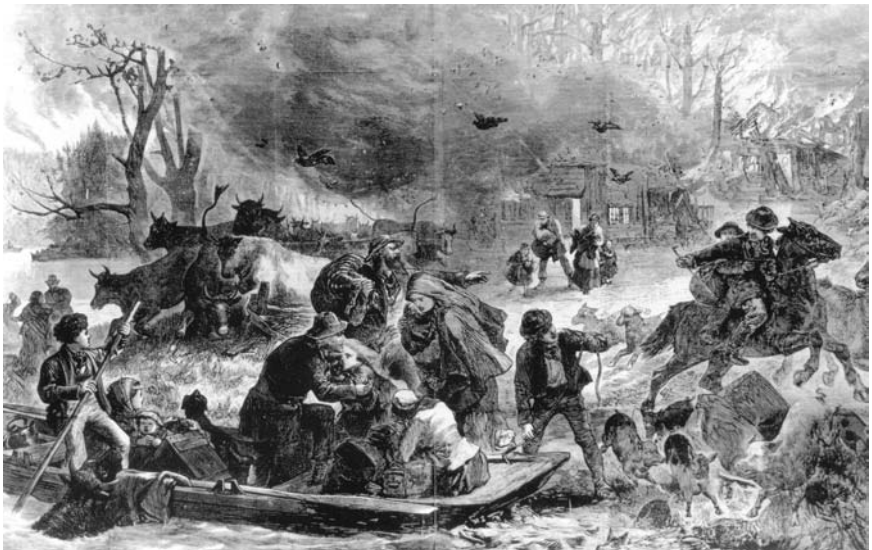
Peshtigo fire as depicted in Harper's Weekly, 1871.

State politics revolved around factions headed by James Doty and Henry Dodge. As political parties developed, the Democrats proved dominant throughout the period.