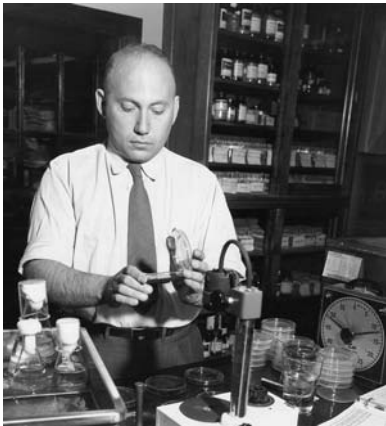
Professor Joshua Lederberg

1957 — Legislation prohibited lobbyists from giving anything of value to a state employee.