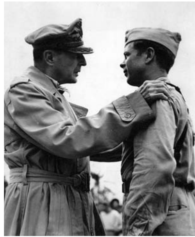
Two sons of Wisconsin met on an airstrip on Leyte Island, the Philippines. On December 12, 1944, General Douglas MacArthur (1880-1964) awarded Major Richard I. Bong (1920-1945), "the Ace of Aces", the Congressional Medal of Honor.

1946 — Wisconsin Progressive Party dissolved and rejoined Republican Party.