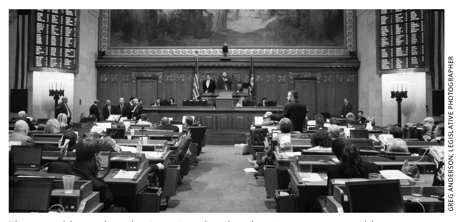
The assembly conducts business in a chamber that is over 100 years old.