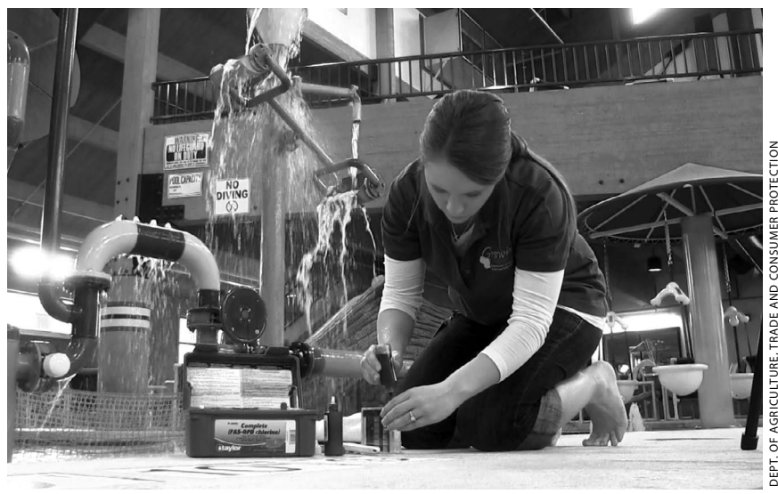
An inspector for the Division of Food and Recreational Safety tests water samples to be sure a water park is safe.