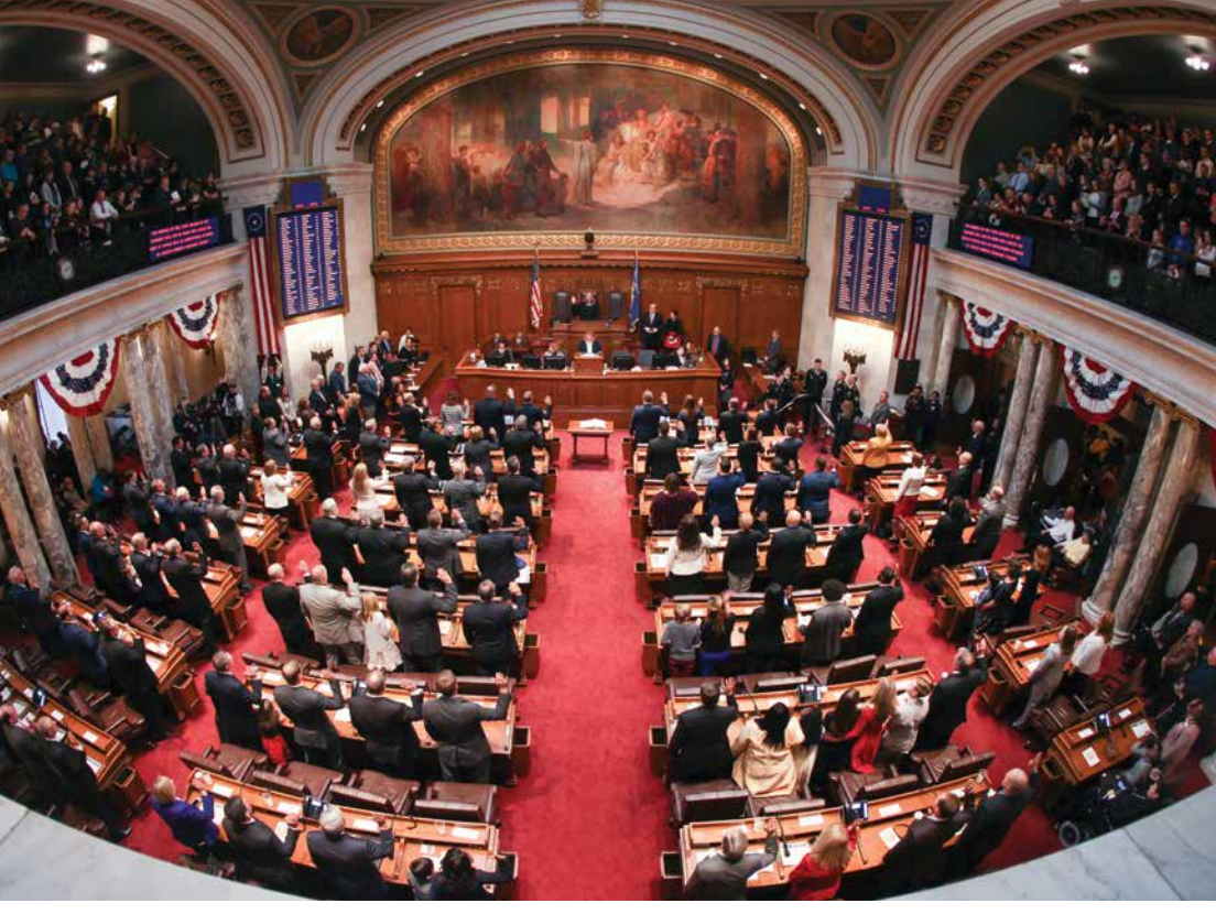
All 99 members of the state assembly take their oath of office on Inauguration Day on January 7, 2019. Each legislator also signs the book pictured at the center on the table, carrying on a tradition that originated with statehood.

A new legislature is sworn in to office in January of each odd-numbered year, and it meets in continuous session for the full biennium until its successor is convened. The 2019 legislature is the 104th Wisconsin Legislature. It convened on January 7, 2019, and will continue until January 4, 2021.