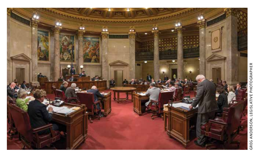
The 33 members of the state senate are elected for four-year terms, and each senator represents more than 170,000 Wisconsinites.