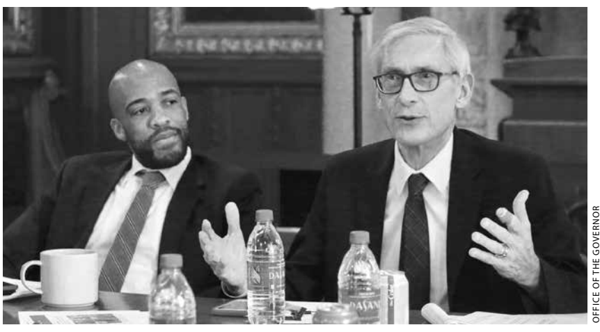
Lieutenant Governor Mandela Barnes (left) is the first African American to hold that office in Wisconsin. Barnes and Governor Evers (right) have held listening sessions around the state in order to hear the policy and budget priorities of Wisconsin citizens.

Website: www.ltgov.wisconsin.gov Number of employees: 5.00 Total budget 2017-19: $764,200