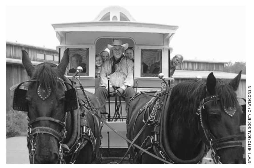
Visitors enjoy a ride in an omnibus at the Wade House historic site, a stagecoach inn from the 1850s that sits at the halfway point between Sheboygan and Fond Du Lac.

Day, and collaborates with other agencies such as Wisconsin Public Television to deliver history programming to the public. The society provides technical services and advice to approximately 400 affiliated local historical societies throughout the state. The society conducts, publishes, and disseminates research on Wisconsin and U.S. history and serves as the state's historic preservation office, which facilitates the preservation of historic structures and archaeological sites and administers the state and national registers of historic places. The society is also responsible for implementation of the state's Burial Sites Preservation Law.