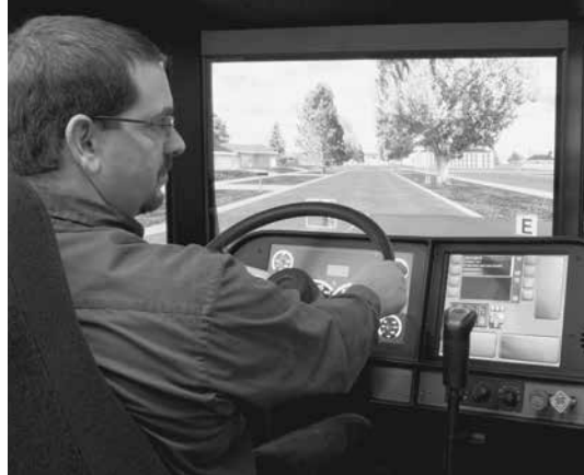
The Wisconsin Technical College System is responsible for training students for a variety of careers. (left) The Fire Service Training program trains professional and volunteer firefighters. (right) The shortterm truck driving program prepares individuals for careers on the road.

sets standards for and approves building projects; oversees district budgets and enrollments; coordinates state and federal grant programs and student financial aid; and supports services for students.