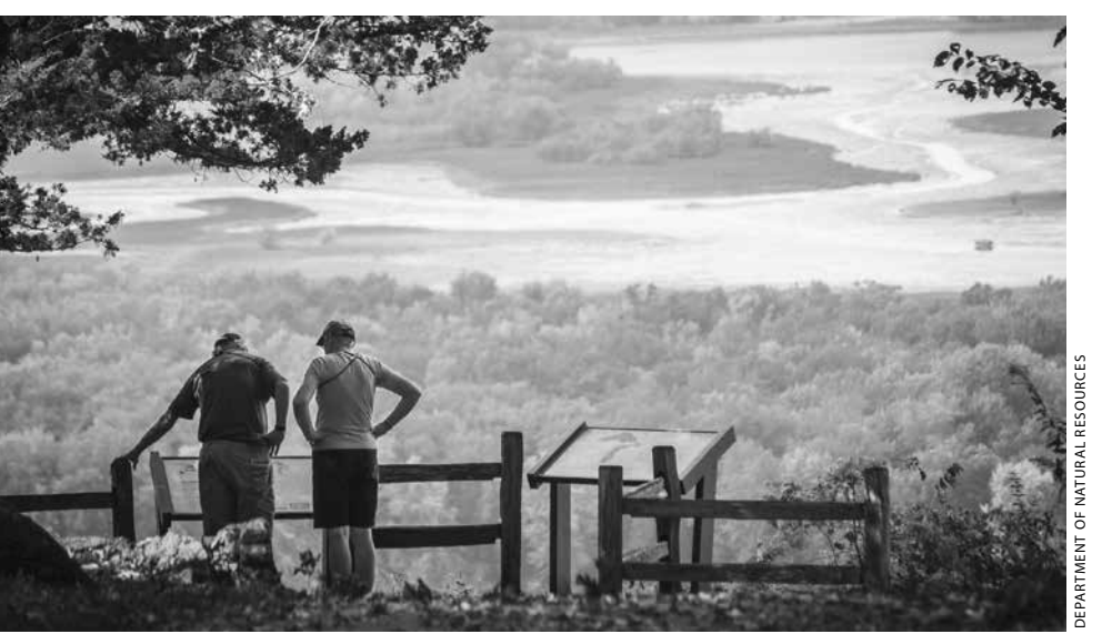
Visitors to the overlook at Wyalusing State Park in Grant County can view the meeting point of the Wisconsin and Mississippi Rivers.

establishments for assistance in the investigation and cleanup of environmental contamination.