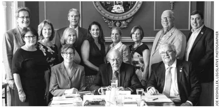
The State Capitol and Executive Residence Board is made of up citizens and state officers who help ensure the integrity of the buildings, furnishings, and grounds of both buildings. The board is pictured at the executive residence, or "Governor's Mansion," that sits on Lake Mendota and has been the home of the governor's family for over 50 years. It was purchased by the state in 1949 for $47,500.