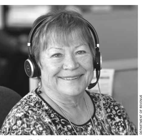
The Department of Revenue provides services to taxpayers by administering the state's tax laws.

the governor with the advice and consent of the senate. The department administers all major state tax laws except the insurance premiums tax and enforces the state's alcohol beverage and tobacco laws. It estimates state revenues, forecasts state economic activity, helps formulate tax policy, and administers the Wisconsin Lottery. The department also determines the equalized value of taxable property and assesses manufacturing and telecommunications company property for property tax purposes. It administers local financial assistance programs and assists local governments in their property as-