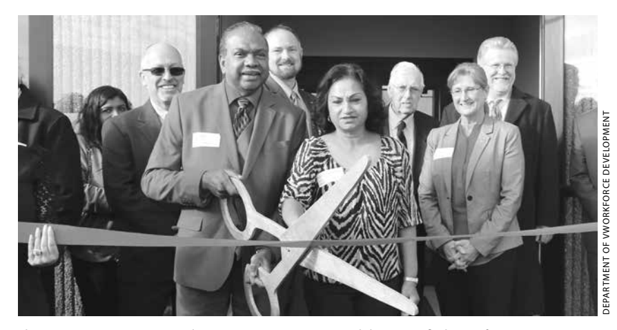
The Wisconsin Economic Development Corporation assisted the Diversified Manufacturing Corporation in identifying a location in Prescott to accommodate the company's growth. The WEDC also authorized up to $520,000 in state tax credits to help the company move to Wisconsin.

expertise and financial assistance to companies that are investing and creating jobs in Wisconsin and to promote new business start-ups and business expansion and growth in the state. The authority was established in 2011 and assumed many of the functions previously performed by the former Department of Commerce. WEDC is governed by an 18-member board that consists of six appointees of the governor, ten appointees of legislative leaders—four appointees each of the speaker of the assembly and senate majority leader and one appointee each of the minority leaders of both houses, and the secretaries of administration and revenue as nonvoting members. WEDC may issue bonds and incur other debt to achieve its public purposes. WEDC's bonds and other debt do not create a debt of the state.