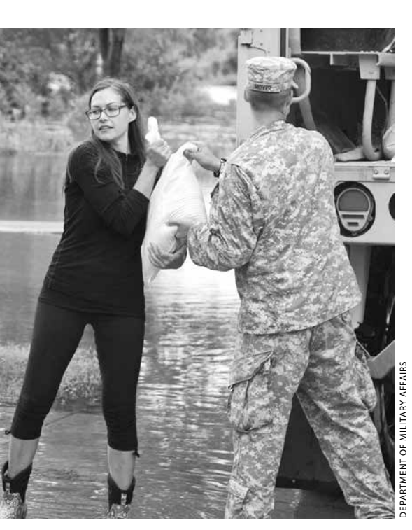
A Wisconsin Army National Guard soldier delivers sandbags to Madison residents during the historic flooding of late summer 2018.