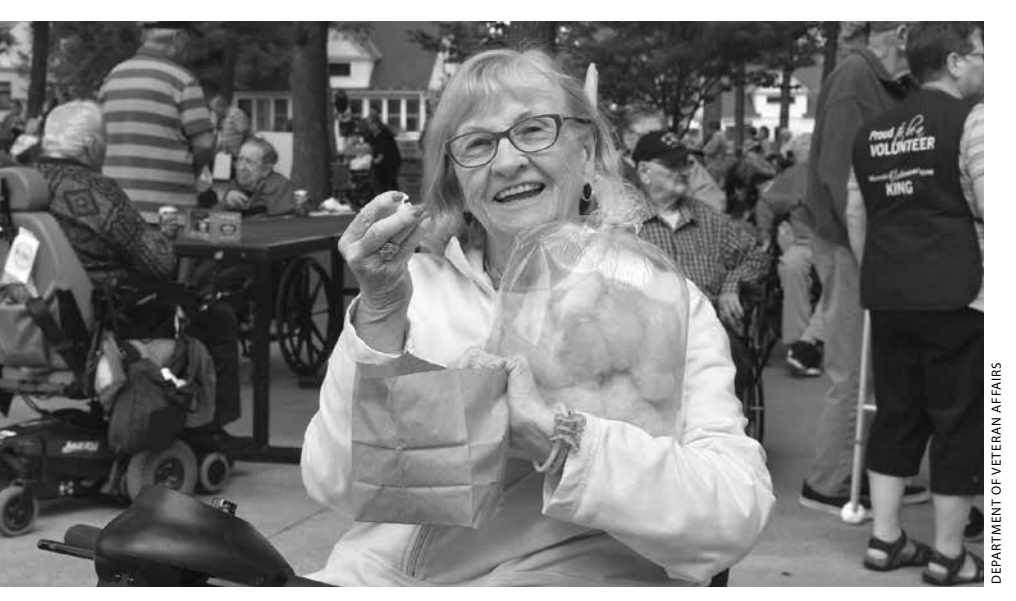
A resident of the Wisconsin Veterans Home at King enjoys her time at a family carnival. The Department of Veterans Affairs operates three homes for veterans and their families in Wisconsin.

and parents of veterans). The department also operates the Southern Wisconsin Veterans Memorial Cemetery at Union Grove, the Northern Wisconsin Veterans Memorial Cemetery near Spooner, and the Central Wisconsin Veterans Memorial Cemetery at King. Finally, the department operates the Wisconsin Veterans Museum in Madison.