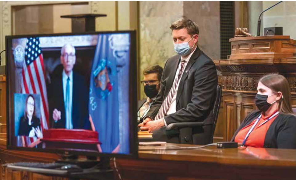
OFFICE OF THE GOVERNOR

Governor Tony Evers delivers his third State of the State address remotely on January 12, 2021, while members of the senate staff look on.