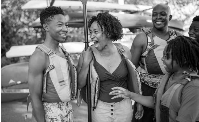
DEPARTMENT OF TOURISM

A family gets ready to kayak on Lake Kegonsa, located in Dane County, southeast of Madison. The lake has four public boat launches, including one in Lake Kegonsa State Park, which is a popular destination for swimming, fishing, kayaking, and canoeing.