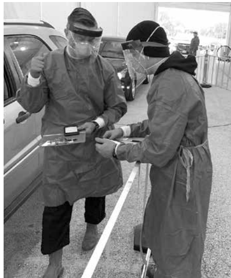
Two Wisconsin National Guard members conduct COVID-19 testing in Milwaukee in October 2020. The Wisconsin National Guard administered more than one million COVID tests during the pandemic.

The Division of Emergency Management coordinates the development and implementation of the state emergency operations plan; provides assistance to local jurisdictions in the development of their programs and plans; administers private and federal disaster and emergency relief funds; administers the Wisconsin Disaster Fund; and maintains the state's 24-hour duty officer