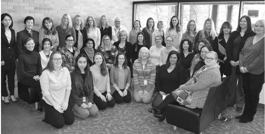
STATE OF WISCONSIN INVESTMENT BOARD

In honor of International Women's Day on March 8, 2020, the State of Wisconsin Investment Board (SWIB) recognizes the innovative, talented, and inspiring women who help make SWIB a trusted global investment organization.