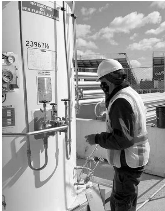
DEPARTMENT OF SAFETY AND PROFESSIONAL SERVICES