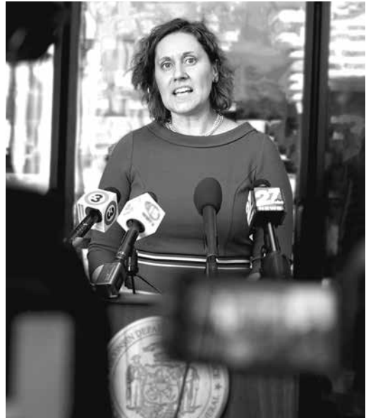
DEPARTMENT OF CHILDREN AND FAMILIES

The department provides or oversees county provision of various services to assist children and families, including services for children in need of protection or services, adoption and foster care services, the licensing of facilities that provide out-of-home care for children, background investigations of child caregivers, child abuse and neglect investigations, and community-based juvenile justice services. The department administers the Wisconsin Works (W-2) public assistance program, including the Wisconsin Shares child care subsidy program, the YoungStar child care quality improvement program, the child support enforcement and paternity establishment program, and programs related to the federal Temporary Assistance to Needy Families (TANF) income support program. The department also works to ensure that families have access to high quality and affordable early childhood care and education and administers the licensing and regulation of child care centers.