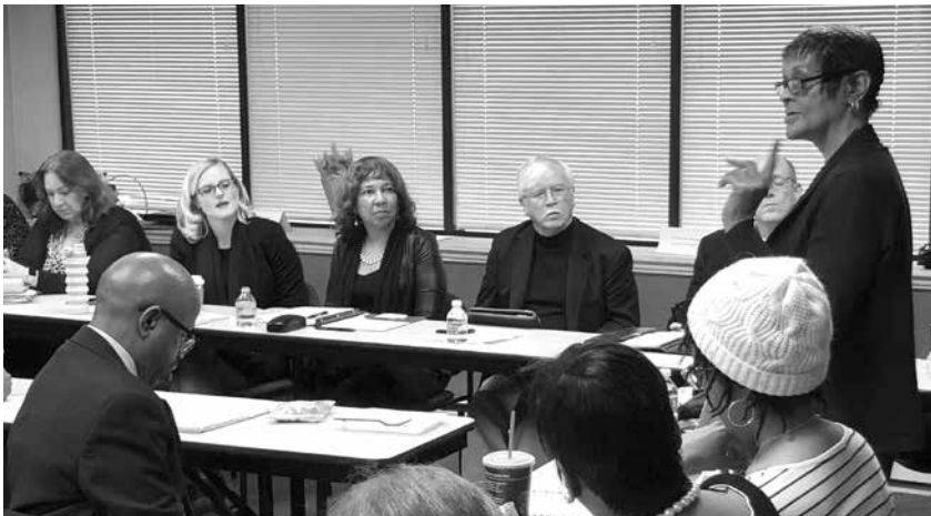
OFFICE OF THE STATE TREASURER