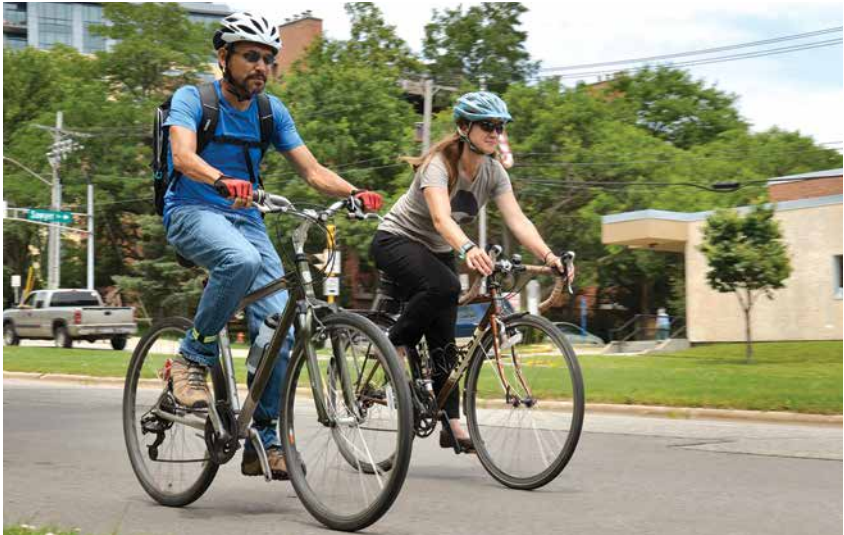
DEPARTMENT OF TRANSPORTATION

Cyclists in Madison enjoy an energizing commute. The Bicycle Coordinating Council aims to improve the health of citizens and communities through its ongoing support of bicycling across Wisconsin.