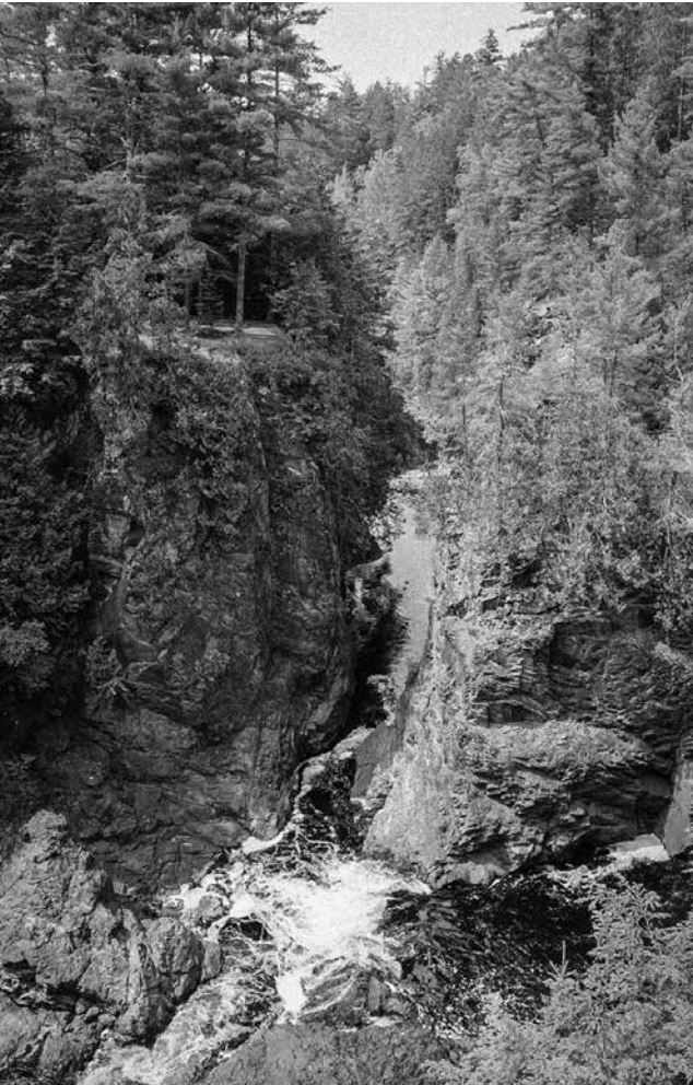
DEPARTMENT OF NATURAL RESOURCES

Visitors to Copper Falls State Park in Ashland County can walk the scenic 1.7-mile Doughboy's Trail, which winds along a rocky gorge where the Tyler Forks River joins the Bad River, and can take in dramatic views of several roaring waterfalls along the way.