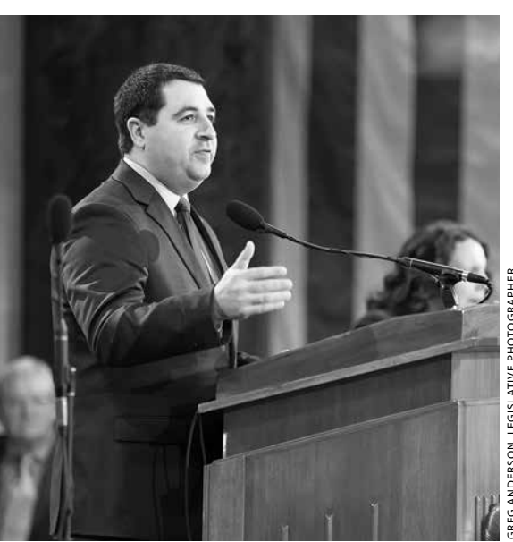
Attorney General Josh Kaul delivers remarks after being sworn in for a second term as Wisconsin's 45th attorney general.

state in criminal cases on appeal in federal court.