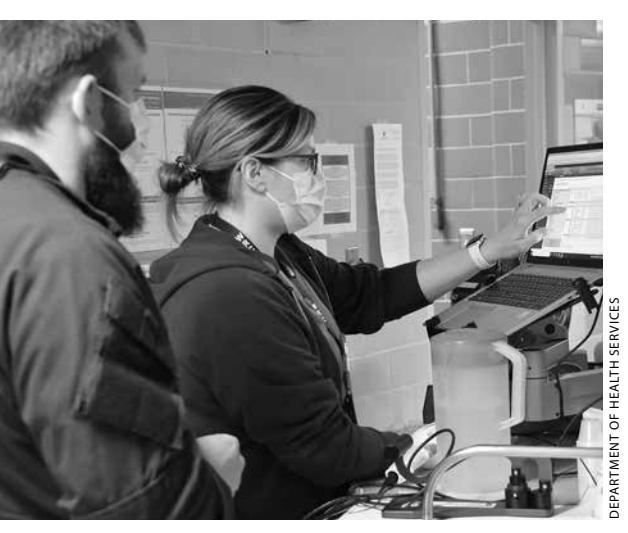
A staff member at the Wisconsin Resource Center reviews a patient's electronic health records. The center develops innovative treatment methods for state prison residents in need of specialized mental health services.