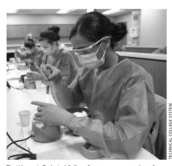
The Wisconsin Technical College System prepares students for a variety of careers. Above, students at Blackhawk Technical College who are training to become dental technicians practice mixing materials for dental molds.

College System. The governor, with the advice and consent of the senate, appoints 10 of the board's 13 members, nine to serve six-year terms and a technical college student to serve a two-year term. Of the nine nonstudent appointees, there must be at least one employer, one nonmanagerial employee, and one farmer. The three remaining board members are the state superintendent of public instruction, the secretary of workforce development, and the