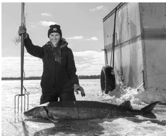
In 2022, the Department of Natural Resources issued more than 800,000 hunting licenses and over one million fishing licenses, including around 13,000 sturgeon spearing licenses. Above, two hunters hike through the woods (left), and a spearer poses with the fish she harvested during the 2023 sturgeon spearing season (right).

rural community fire protection program. In addition, the council provides fundamental guidance on the administration of the Forest Fire Protection Grant.