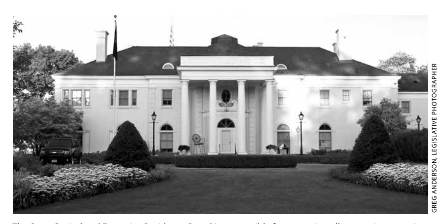
The State Capitol and Executive Residence Board is responsible for approving all renovations, repairs, furnishings, and fixtures on the grounds of the Wisconsin State Capitol and the Governor's Mansion, pictured here. The mansion sits on Lake Mendota and has been the home of the governor's family for over 50 years.

The State Capitol and Executive Residence Board (SCERB) ensures the architectural and decorative integrity of the buildings, decorative furniture, furnishings, and grounds of the capitol and executive residence and directs the continuing and consistent maintenance of the properties. No renovations, repairs (except of an emergency nature), installation of fixtures, decorative items, or furnishings for the ground and buildings of the capitol or executive residence may be performed by or become the property of the state by purchase wholly or in part from state funds, or by gift, loan, or otherwise, until approved by the board as to design, structure, composition, and appropriateness.