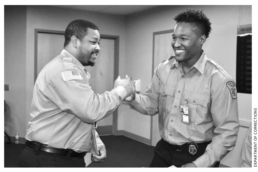
Correctional officers share congratulations after graduating from the Department of Corrections' Officer Pre-Service Academy.

Location: 3099 East Washington Avenue, Madison