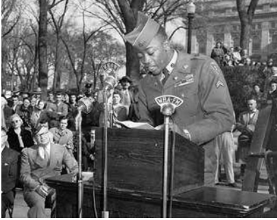
WHS IMAGE ID 68083