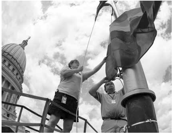
A rainbow flag at the Capitol.