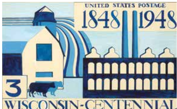
Wisconsin Centennial postage stamp.

1950. Approximately 132,000 Wisconsinites served during the Korean Conflict, and 747 died.