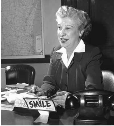
WHIS IMAGE ID 84154