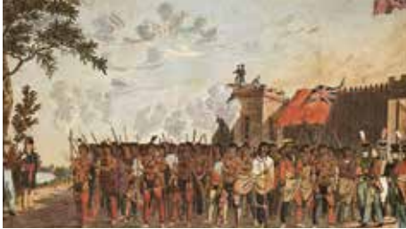
Fort Shelby, renamed Fort McKay.

1815. The War of 1812 concluded, leading to the abandonment of Fort McKay (formerly Fort Shelby) by the British.