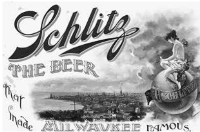
Schlitz Brewing Company.

Brewery Company of Detroit acquired the Schlitz Brewing Company and closed all Milwaukee operations.