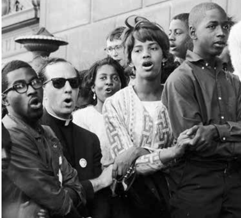
Father Groppi with civil rights activists.