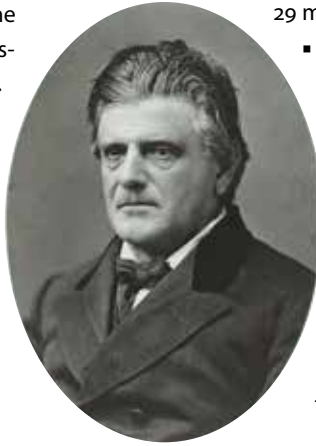
Governor Nelson Dewey.

1848. The second proposed state constitution was adopted. ▪ President Polk signed a bill on May