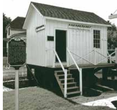
WHS IMAGE ID 44620

amended to make legislative sessions biennial. ▪ The world's first hydroelectric plant was built in Appleton.