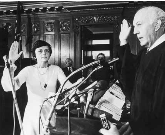
Shirley Abrahamson takes her oath of office.

1982. State unemployment hit the highest levels since the Great Depression. ▪ Voters endorsed the first statewide referendum in the nation calling for a freeze on nuclear weapons. ▪ Stroh