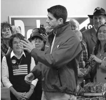
Vice Presidential candidate Paul Ryan.

2014. Voters passed a constitutional amendment requiring that transportation fund resources be used only for transportation. ■ Court rulings legalized