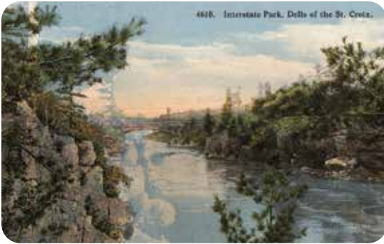
Wisconsin's first state park.